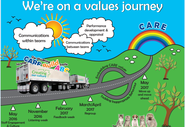
The CARE values journey.