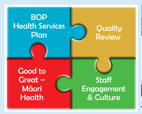
BOPDHB's four strategic priorities.