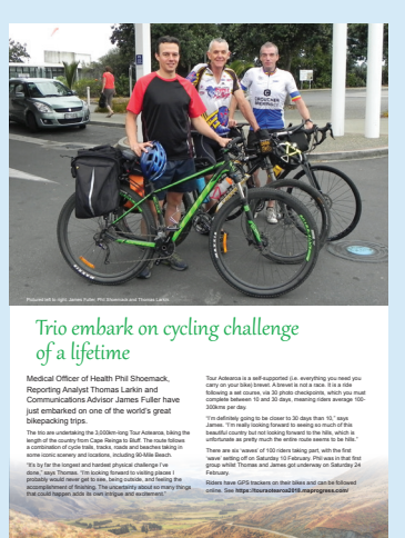
Stories taken from Checkup.