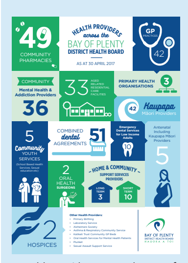
Health providers across the Bay of Plenty in 2017.

End PJ paralysis by encouraging older patients to get up, get dressed and get moving.