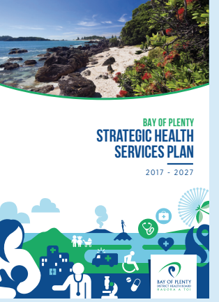
Cover of Strategic Services Plan.