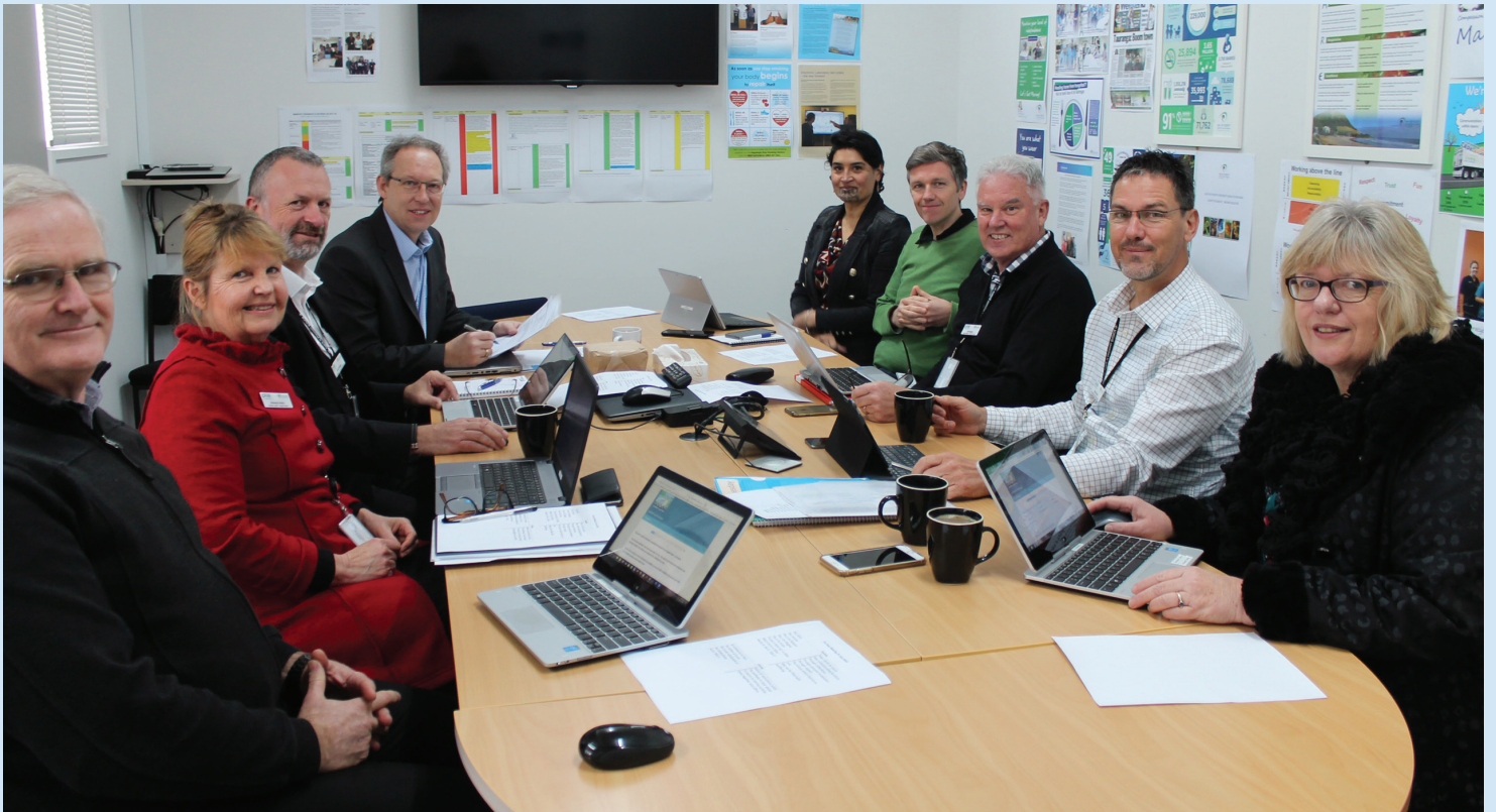
The Executive Team filling out their BOPDHB Travel Plan Surveys.

More information is available on OnePlace or click here to go straight to the survey.