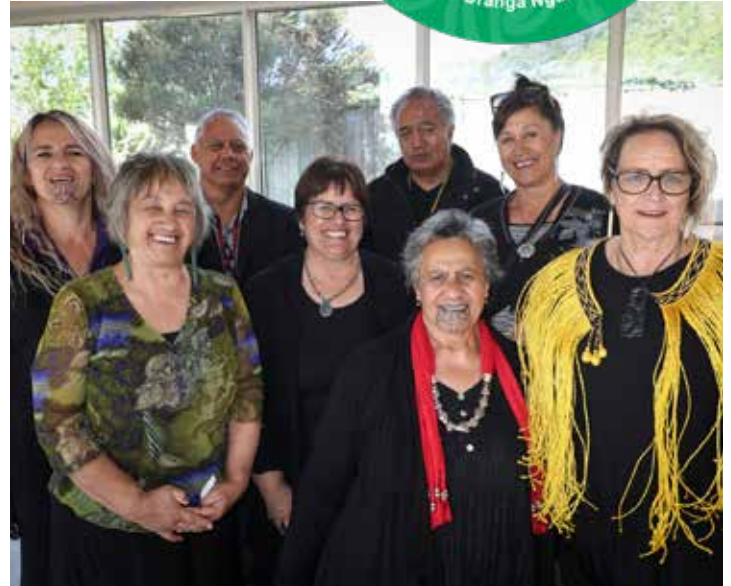
Staff and whānau enjoying the Whakatāne event.

A highlight of my first week as Interim CE has been the Staff Recognition Awards ceremonies in Tauranga and Whakatāne.